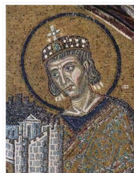
St. Constantine summoned the bishops of the Christian Church to Nicaea to address divisions in the Church. (mosaic in Hagia Sophia, Constantinople, c. 1000)

A special prominence was also attached to this council because the persecution of Christians had just ended with the February 313 Edict of Milan by Emperors Constantine and Licinius.