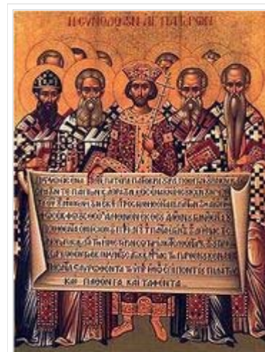
Icon depicting the Holy Fathers of the First Council of Nicaea holding the Nicene Creed.